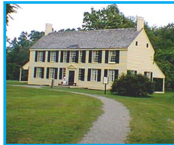
Philip Schuyler House

{Sarachtogoe - Iroquois for (old) Saratoga}