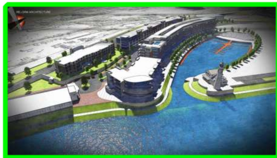
The Future Mohawk Harbor Place