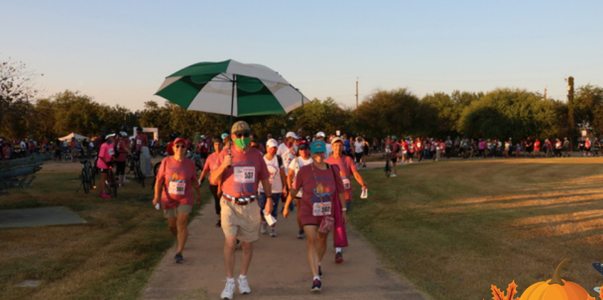
Tour de las Misiones Walk - The vanguard of the Volkssporters at the beginning of the walk.