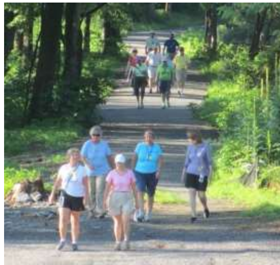
6:00 pm walkers