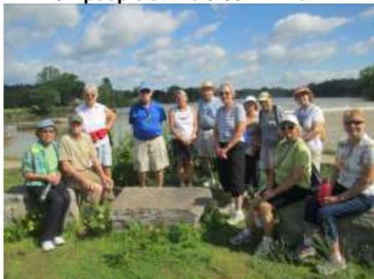
Our 600th walk in Saratoga Springs – 8/30/14