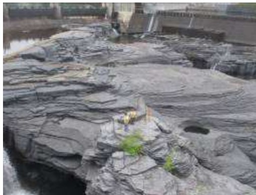
View of surveyors from the bridge.