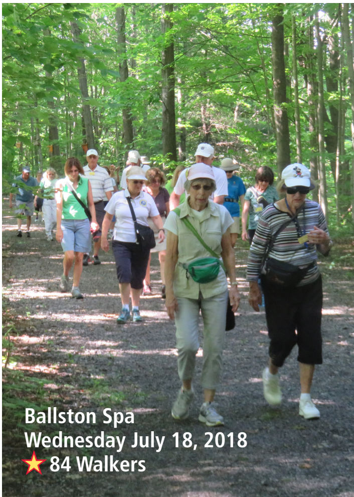
Ballston Spa Wednesday July 18, 2018 ★ 84 Walkers