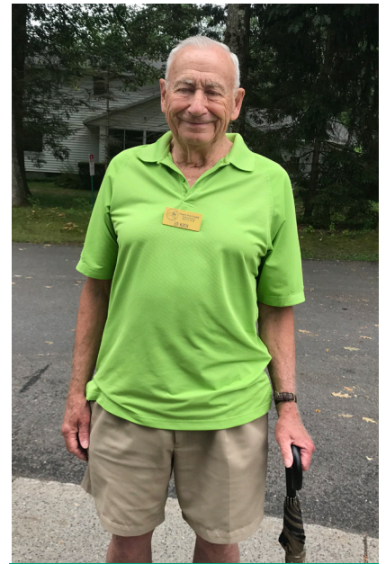
Happy Birthday Ed Koch August 1 Saratoga East Side ★ 53 Walkers