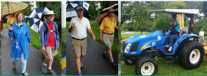
Schenectady - River Walk August 22, 2018 ★ 36 Walkers