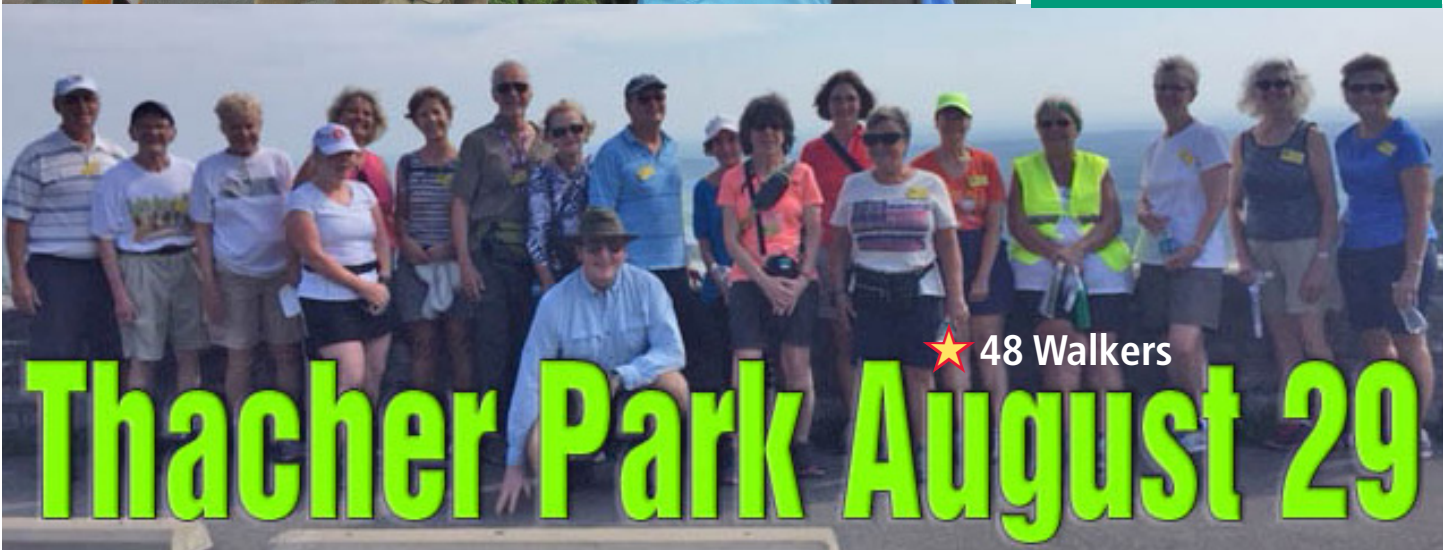
★ 48 Walkers