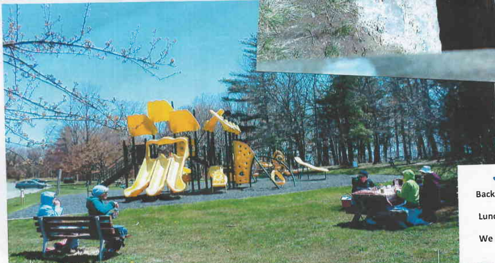
Back to the playground area where we ate Lunch - note social distancing. Due to COVID-19 We couldn't use the slides..