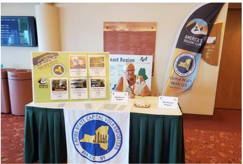
Continued from page 1

International Federation of Popular Sports http://www.ivv-web.org/