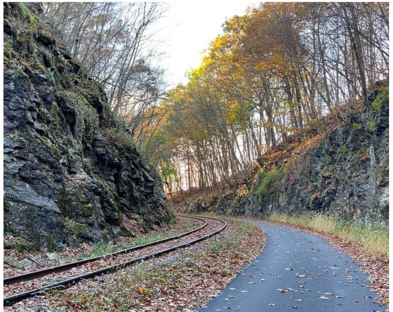
The Poughquaq Cut on the Maybrook section of the Empire State Trail

This looks like a well planned trail for all users. I hope there are some volkswalking clubs that have some or will be able to develop some walks along this trail.