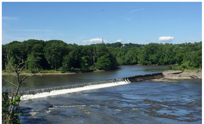
Photo I (Patricia Jewett) took in 2019 while at the Albany AVA Convention. This is from Peeble Island State Park