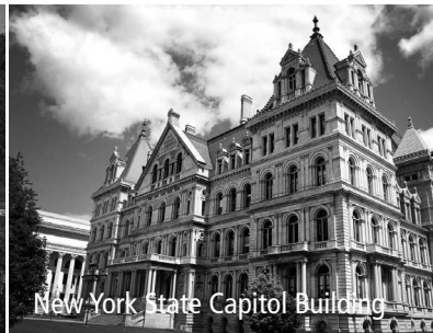
New York State Capitol Building