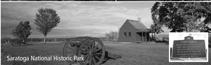
Saratoga National Historic Park